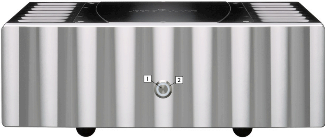
Figure 1: Front Panel