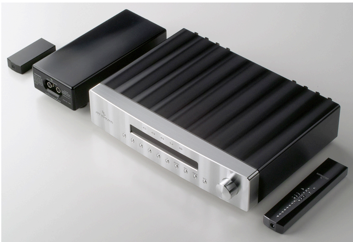
Figure 1: Corus components (cables not shown)

CUSTOMIZATION: Inputs can be custom named and set for different gain structures and automatically stored in internal memory.