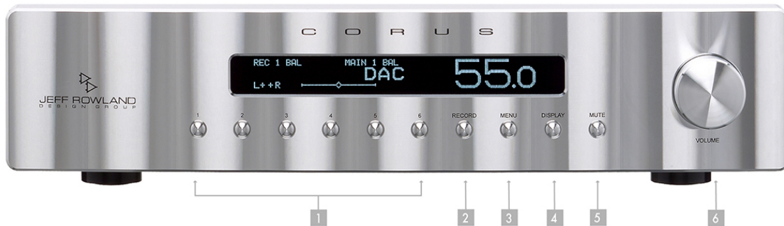
Figure 3: Front Panel Controls