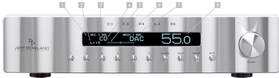
Figure 2: Front Panel Display