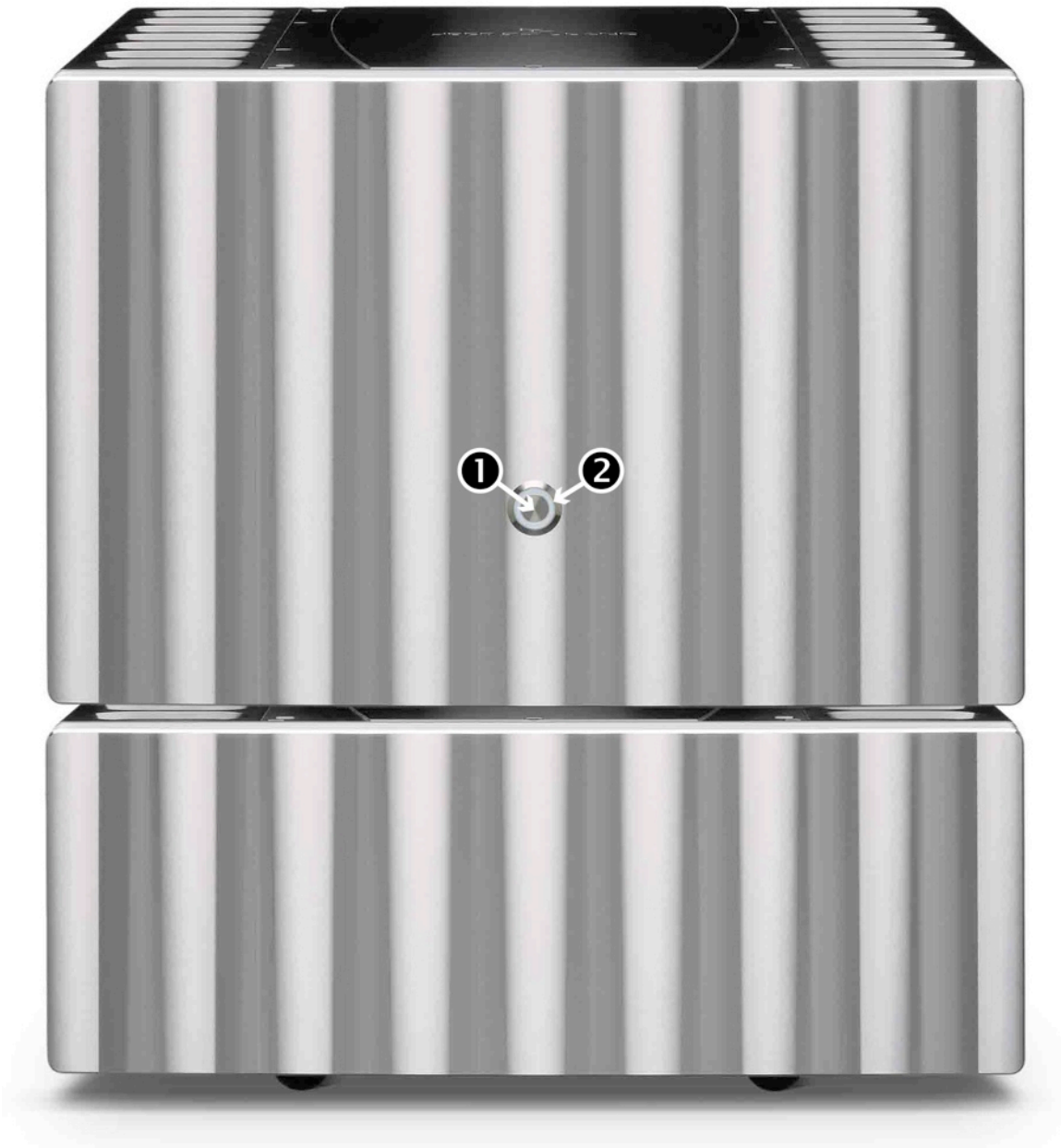
Figure 1: Front Panel