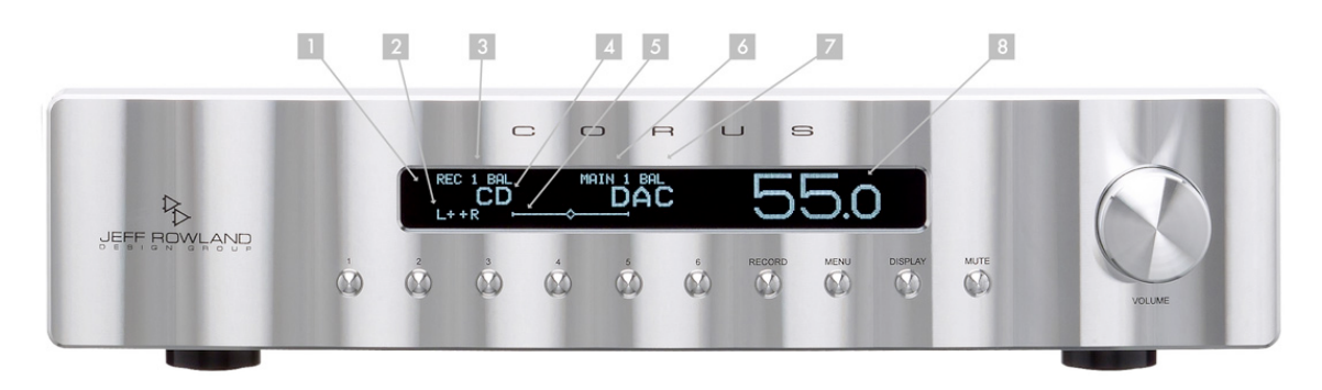
Figure 2: Front Panel Display