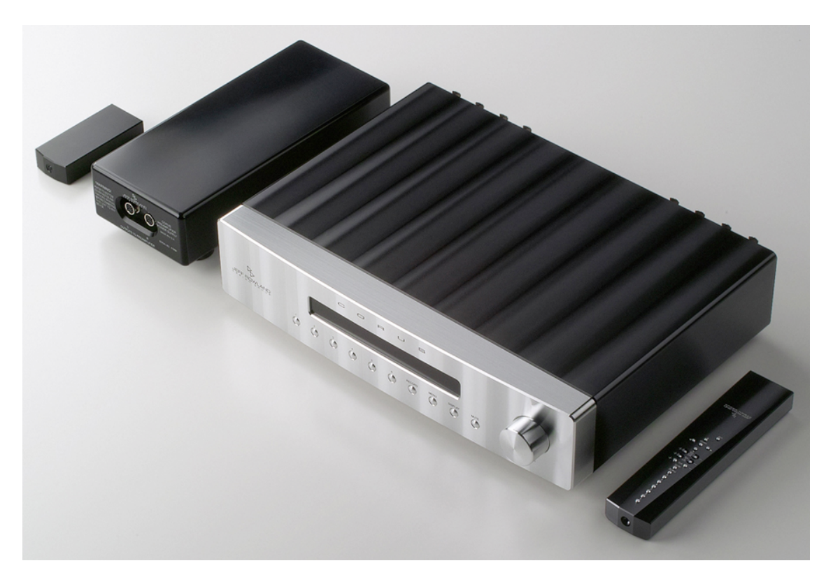
Figure 1: Corus components (cables not shown)

CUSTOMIZATION: Inputs can be custom named and set for different gain structures and automatically stored in internal memory.