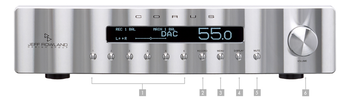
Figure 3: Front Panel Controls