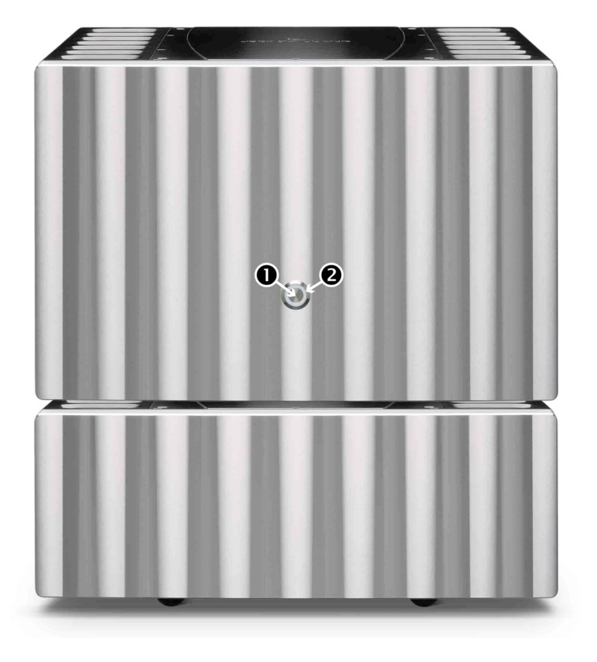
Figure 1: Front Panel